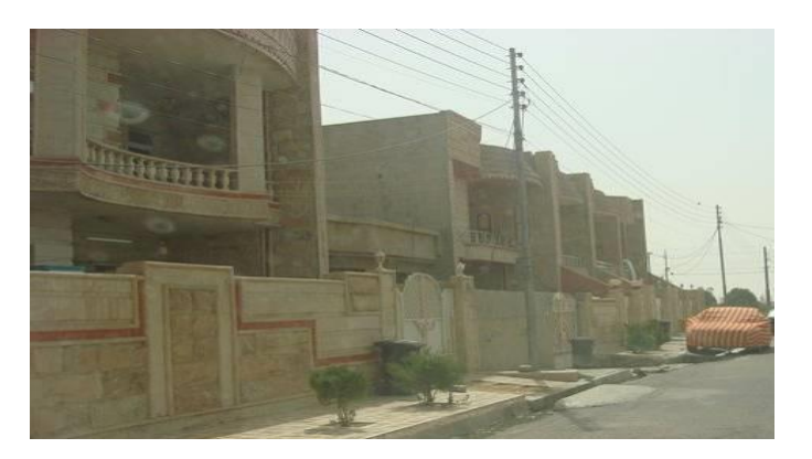
Fig. 5. Houses without garden after 2003.

After liberation of Iraq in 2003, architecture in Erbil City has gone through major changes and passed through rapid transformations due to economic developments, (Fig. 2, sixth stage). Consequently, Peace, relative prosperity, and democracy began to grow in the region (Gunter., 2004). This period can be considered as golden era of the city evolution. Many of development projects have been constructed and the urbanization process reached its climax. The rapid growth of the construction and housing sector led to a state of