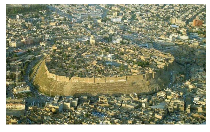
Fig. 1. Erbil Citadel City

Throughout its 6,000 years of urban civilization, the Erbil city architectural tradition has been categorized by architectural principles that highlighted the building with nature, Fig. 1. In order to crystallize house garden landscape modernity categories in Erbil city, and for the purpose of data collection, the study will divide the periods of Erbil city evolutions into four categories.